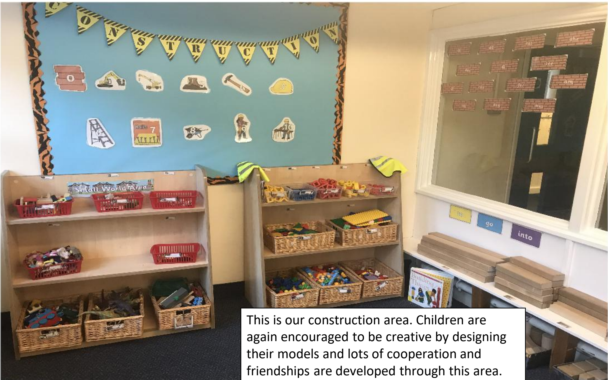
This is our construction area. Children are again encouraged to be creative by designing their models and lots of cooperation and friendships are developed through this area.