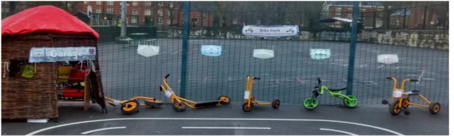
Children have the ability to access the curriculum outdoors too, on a larger scale.